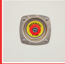
Emergency stop button