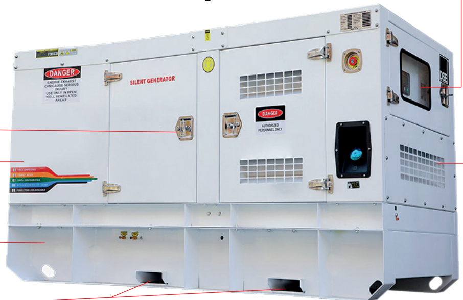
Easy maintenance easily removable side part

Reinforced anti-rollover forklift tunnels for safe handling