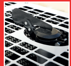
Exhaust terminal pipe with tilting cap rain over