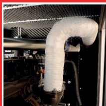
Exhaust pipes with exhaust heat wrap for high-performance and security