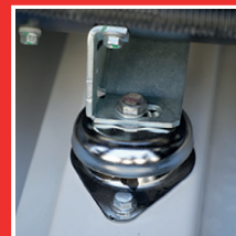
Anti-vibration pads attenuate vibrations caused by the unit