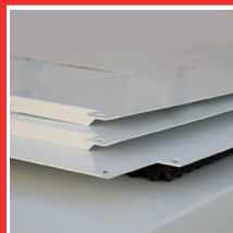
Galvanized metal sheet to increase strength & durability