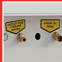
Oil and coolant drain