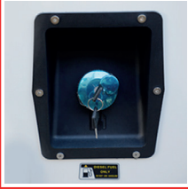
Fuel filling point with key lock