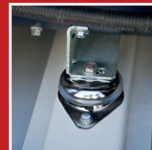
Anti-vibration pads attenuate the vibrations caused by the unit