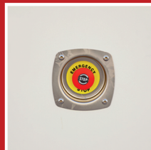
Emergency stop button It shuts down the generating set immediately