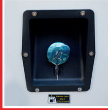
Diesel filling with key lock

Engines Selected from the heavy duty product and optimized for low quality fuel