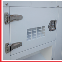
Document holder Protects documents