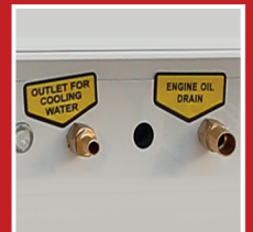
Oil and Coolant Drain