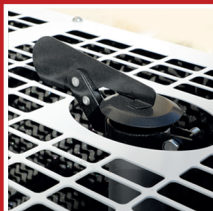
Exhaust terminal pipe with tilting cap rain over