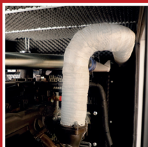
Exhaust pipes with exhaust heat wrap for high-performance and security