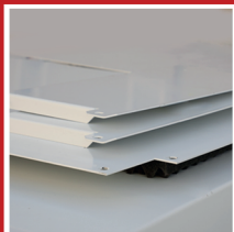
Galvanized metal sheet to increase strength and durability