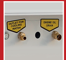
Oil and Coolant Drain