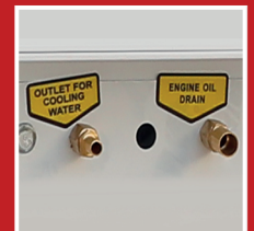
Oil and Coolant Drain