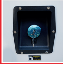
Diesel filling with key lock

Engines Selected from the heavy duty product and optimized for low quality fuel