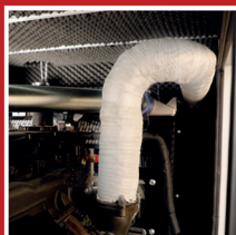
Exhaust pipes with exhaust heat wrap for high-performance and security